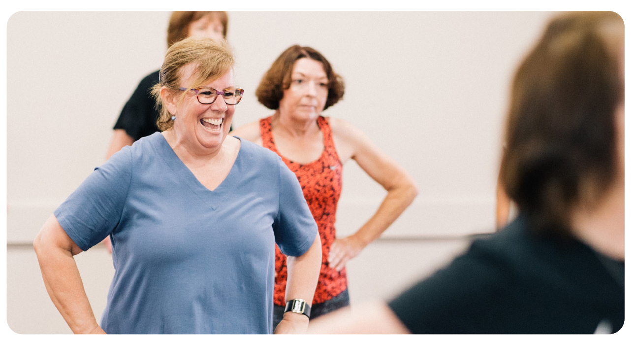
10 tips for creating healthy habits | Page 2

Achieving your goals is more likely to happen if you develop a plan that outlines when you'll work towards that goal. For example, if you plan to complete 30 minutes of balance exercises per week, you could decide to do your exercises each morning after breakfast. This can help create a mental link between breakfast and exercise, which makes sticking to your new habit easier.